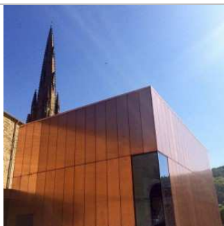
Square Chapel Arts Centre