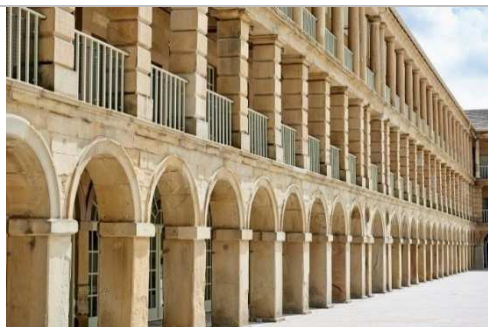
The Piece Hall