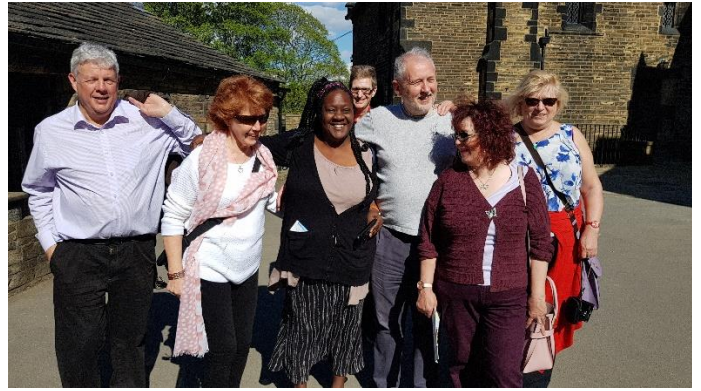
Some views of Shibden Hall