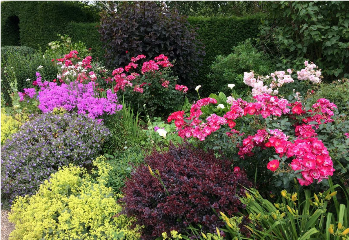
Bergh Apton, Norfolk

For the latest news and up to date information, look at our website or check out our Facebook pages.